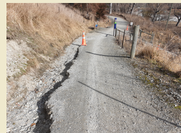
OLD SCHOOL ROAD