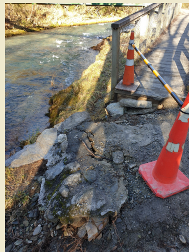
ARROW RIVER BRIDGES TRAIL